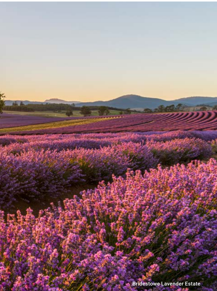
Bridestowe Lavender Estate