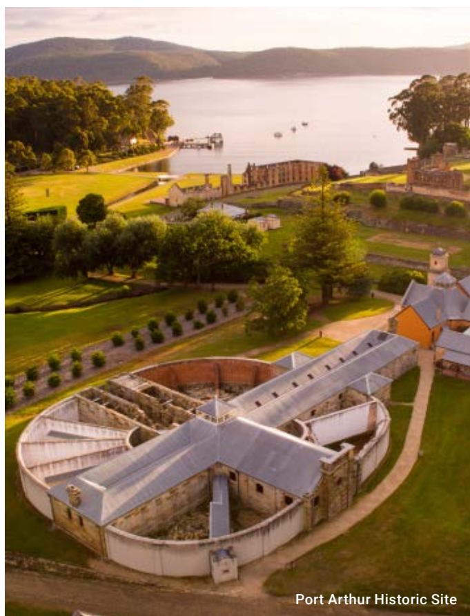
Port Arthur Historic Site

Start & end your tour in Hobart. See Tasmanian Wonders page 74.